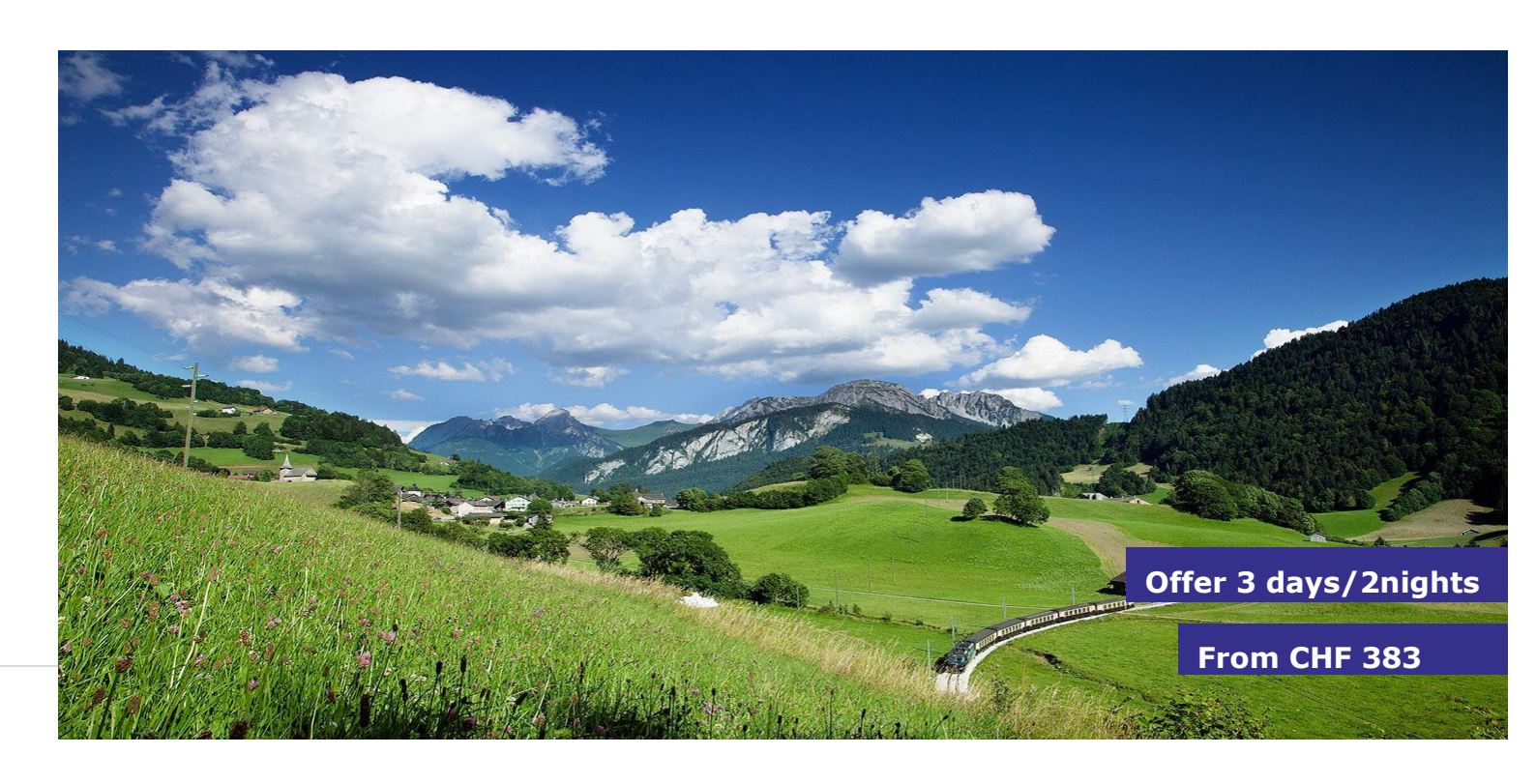
On the tracks of the GoldenPass Line Lucerne – Interlaken – Montreux